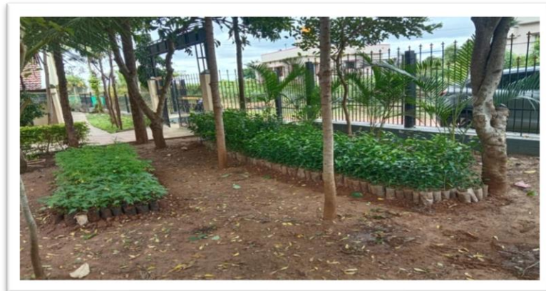
Orange, lime, papaya and drumstick plants ready for distribution

The objective of the program is to encourage village poor to develop dry-land orchard / gardening in dry-lands / semi irrigated lands. Accordingly 394 orange, 377 lemon, 192 drumstick and 111 papaya plants distributed to 137 farmers from 12 selected villages in Hunsur block, Mysore District for developing dry-land orchard / gardening in their farm lands and in backyard lands.