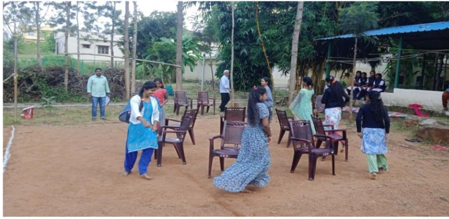
In the sports meet girls are participating in musical chair game