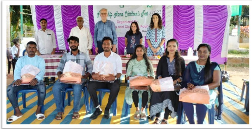
CKF Representatives honoured the outgoing successful graduates, post - graduates and profesional degree / diploma holders