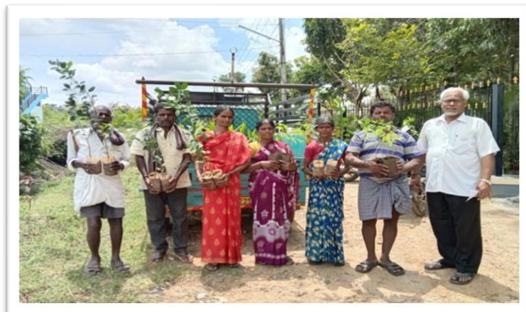
Farmers are receiving orange, lemon, drumstick, papaya, coffee & pepper plants