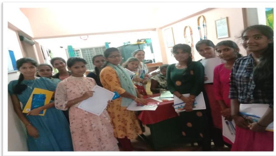
Fostership Home girls are receiving education materials