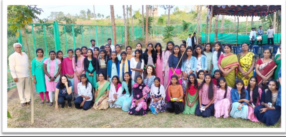
Parivarthana Fostership Home Students and staff photo