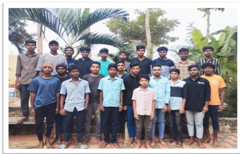
Present boys in Fostership home

SPORTS MEET: Sports meet was organized on 7 th October. In the sports meet volley ball, pot breaking and musical chair games competition were organized. Boys were played volley ball and girls were played pot breaking and musical chair. For winners prizes were distributed on 29 th November, 2023 during CKF representatives visit.