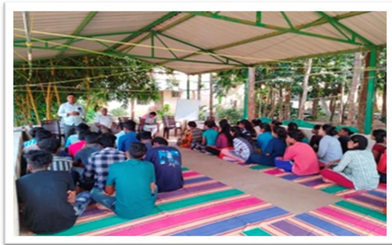
Discussing children issues in monthly meeting