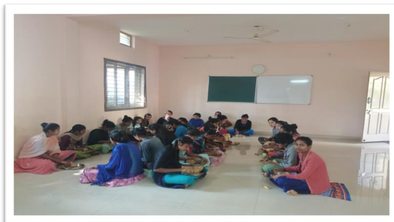
Fostership Home girls are taking Breakfast

Food & Accommodation: Nutritive food served for 80 children who are present in FH. Likewise accommodation provided for 80 children with all facilities.