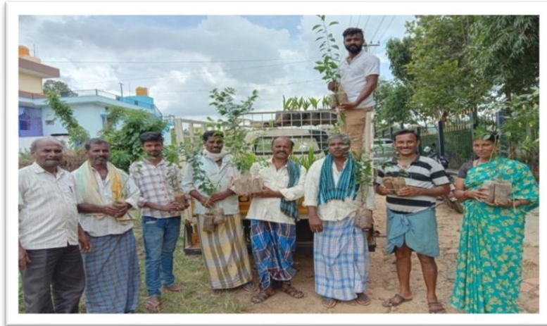
Farmers are receiving orange, lemon, drumstick, papaya, coffee & pepper plants

In total 2453 plants distributed to 138 farmers from 12 villages of Hunsur block, Mysore District. Out of 2433 plants - 1077 coconut, 394 orange, 377 lemon, 197 drumstick, 111 papaya, 201 coffee and 96 pepper plants.