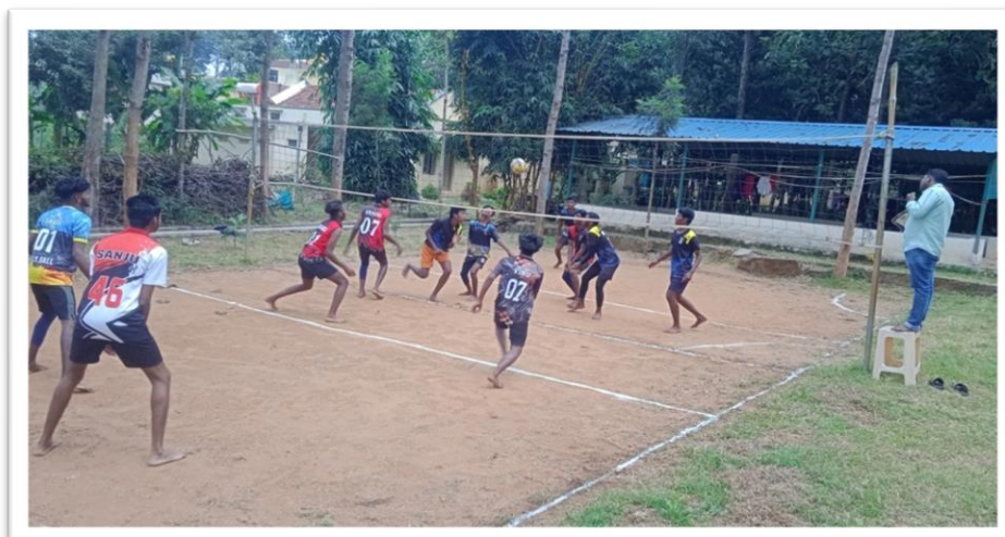
In the sports meet boys are playing Volley ball

SPORTS MEET: Sports meet was organized on 7 th October. In the sports meet volley ball, pot breaking and musical chair games competition were organized. Boys were played volley ball and girls were played pot breaking and musical chair. For winners prizes were distributed on 29 th November, 2023 during CKF representatives visit.