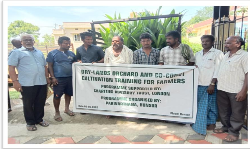
Coconut plants distributed to selected farmers