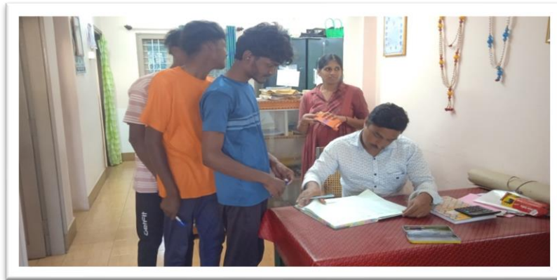
Fostership Home boys are receiving education material

Supply of Education and Sports Materials: 51 girls & 29 boys have received required education materials like note books, pens, pencils, erasers, sharpeners, drawing sheets, blue books, white sheets, Xerox copies of lesson plan & subject notes, calculator, geometry box and practical records etc. Volley ball net and ball provided for FH boys and also TV recharged for entertainment in both girls and boys Fostership home.