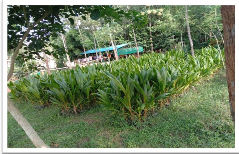
Coconut plants growing in nursery

Parivarthana convey its heartfelt thanks to Ciao Kids Foundation and Charities Advisory Trust / Good Gifts Catalogue for the generous support to help the children for education and farmers in the area.