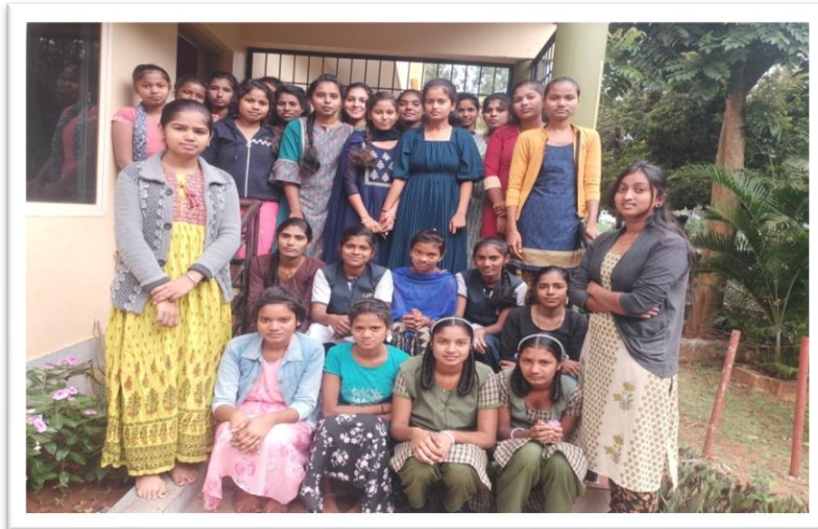
Present Girls in Fostership home