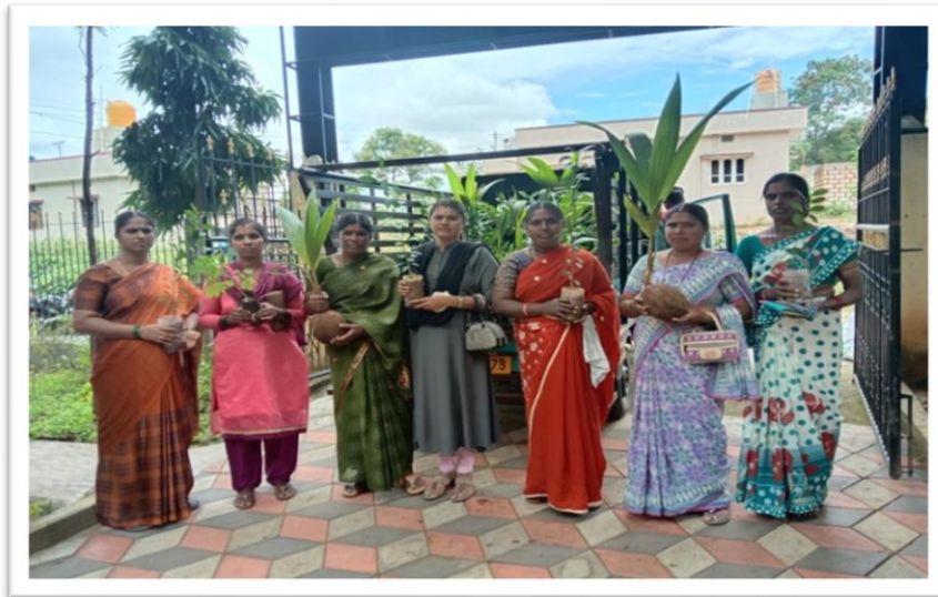
SHG members are recevieng coconut plants

For coconut gardening activity 72 farmers selected from 3 villages that have bore-well / semi irrigated lands for cultivation of coconut plants. For these 72 farmers 1077 coconut plants distributed during monsoon.